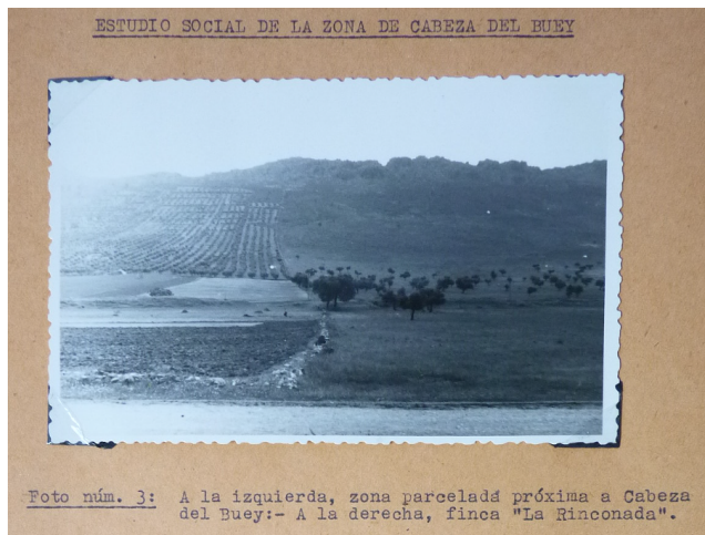
Figure 2: The Rinconada farm, declared to be of "national interest", in February of 1949, compared to an organized farm. "Terron, Estudio social del Término de Cabeza del Buey", AHCEA.

Organized, parceled up farms were much more desirable than wild dehesas . Any farm not divided up into parcels, especially if it was owned by an absentee landlord, could be subject to expropriation. In photos attached to the appendix of the Cabeza del Buey study, Terrón pointed out the border between two farms, one with the scattered brush and trees of the dehesa landscape typical of the region, while the other was made up of neat lines of crops.